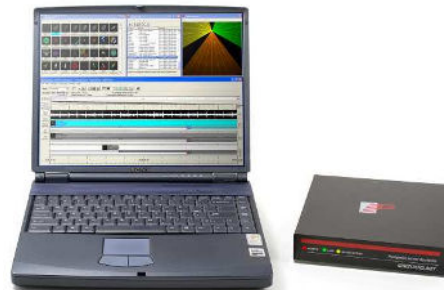
The "laptop-friendly" version of QM2000.NET is the best way to run Pangolin's LD2000 software on computers without card slots, such as notebooks.